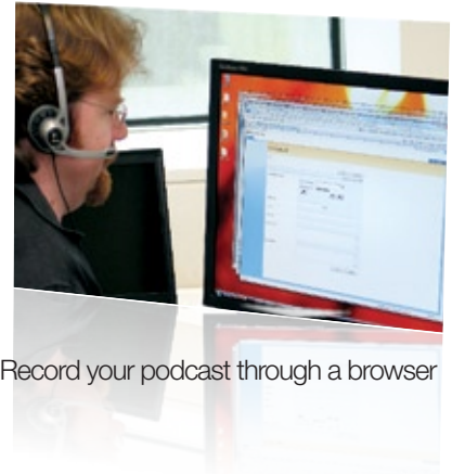
Record your podcast through a browser